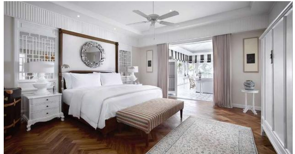
BEDROOM - UPPER FLOOR