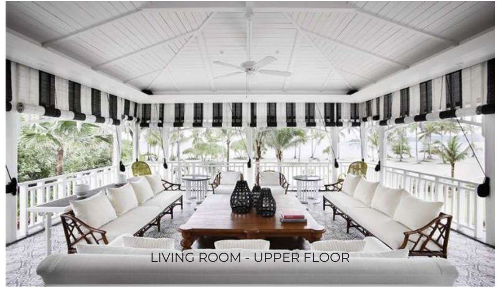
LIVING ROOM - UPPER FLOOR