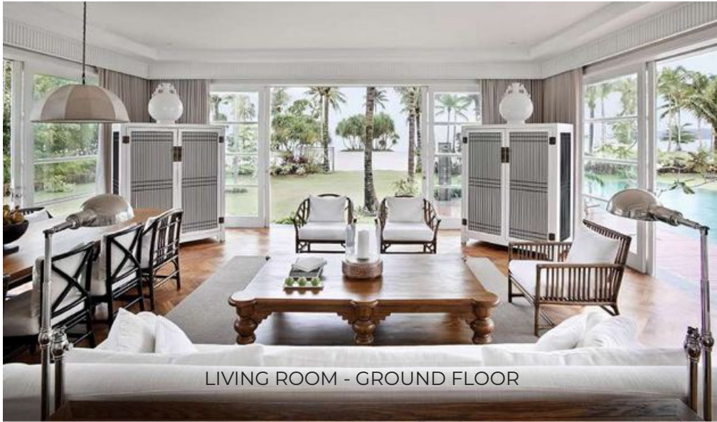
LIVING ROOM - GROUND FLOOR