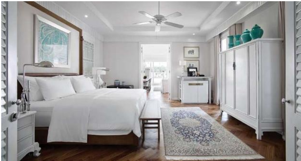
Master BEDROOM - GROUND FLOOR